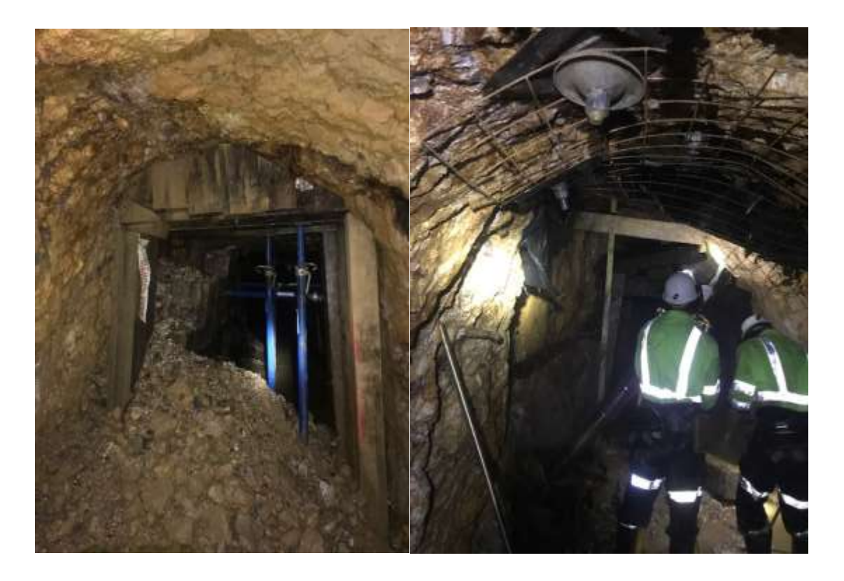
Figure 2 – Before and after photos of rehabilitation work at the old ore pass