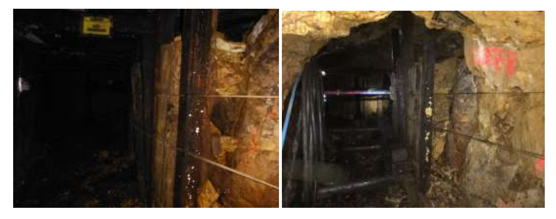
Figure 4 – Work in progress in the second bypass