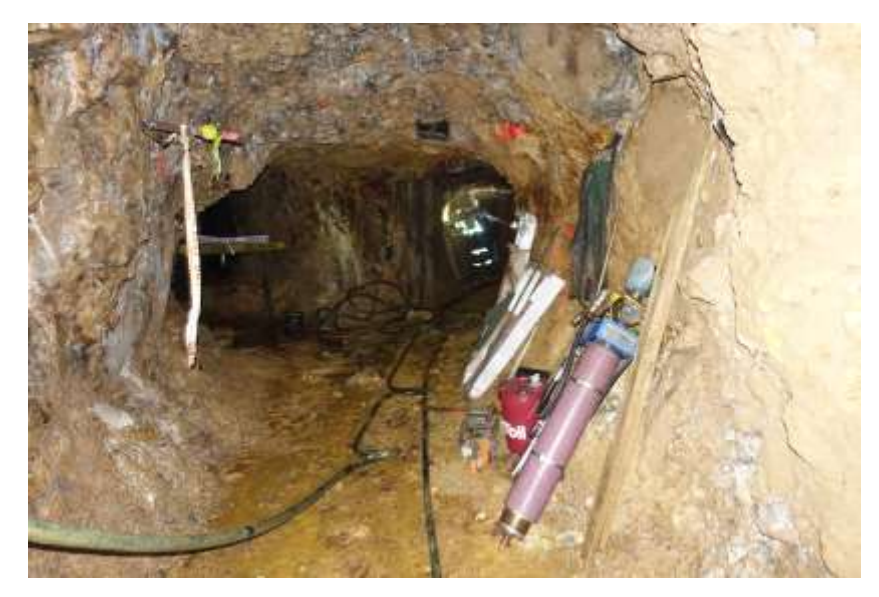
Figure 5: Work continues 540 metres underground