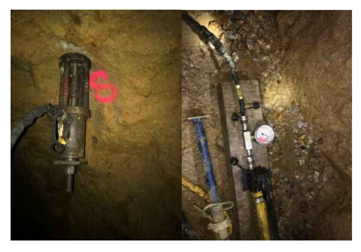
Figure 3 - Rock bolt undergoing pull tests after installation. A hydraulic jack is attached to the anchor and load applied to the bolt. This tests the performance of the contact between the bolt, the resin and the ground being supported.

In order to check the quality of support installed underground pull testing was carried out on rock bolts underground with very positive results indicating that the materials and installation are of good quality.