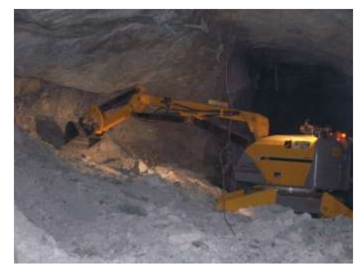
Figure 7 - A Brokk 400D being used in underground narrow vein operations

areas. The Brokk 180, pictured below, is an example of the type of equipment under consideration which allows multiple attachments, including rock drill and buckets, and can be easily controlled by one person. As far as we are aware this will be the first time that this type of technology has been deployed in the NZ underground mining environment.